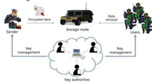
Fig.2: System Architecture.